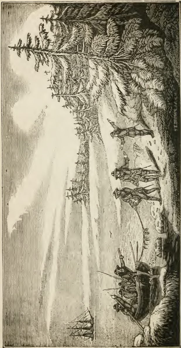
Landing of the Pilgrims at Plymouth, December 22, 1620